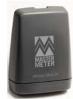
3G XTR™ Connects with existing absolute encoders