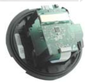
3G PWR™ (For Solid State 2-Board Electric Meters)