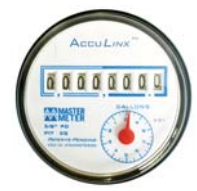
AccuLinX™ 8-Wheel Absolute Encoder