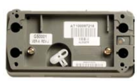
3G GAS™ (Retrofits 97% of Gas Meters in North America)