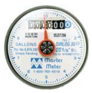
Standard 3G Register