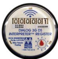
Interpreter Universal AMR Register